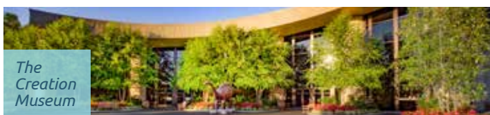
The Creation Museum