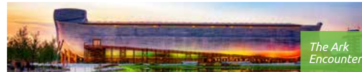
The Ark Encounter